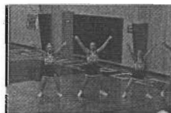
CHS cheerleaders try to get the crowd involved.